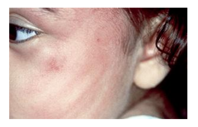
This pattern signals the blow of a hand to the face of a child. (Source: Research Foundation of SUNY, 2011.)