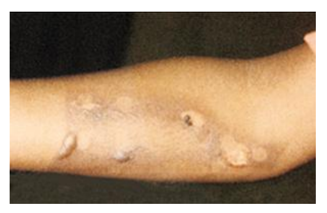
A steam iron was used to inflict injury on this child.